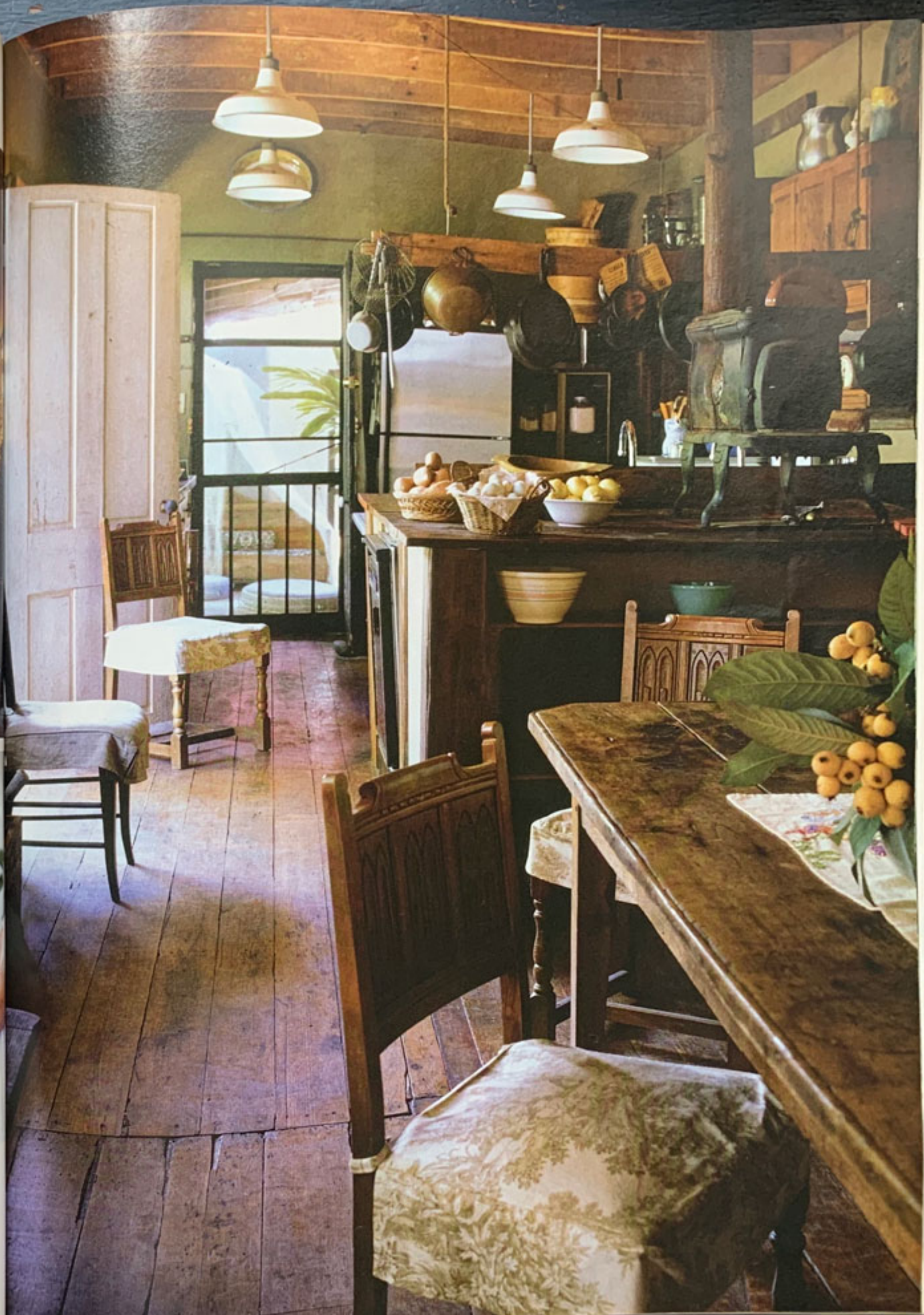
Opposite page: The kitchen has a rustic ambiance with the wide plank wood floors, wood-beam ceiling and an old European farm table. The cast iron stove can be used for heat. The wall’s paint color is “Lafonda Sagebrush” from the American Traditions Collection.